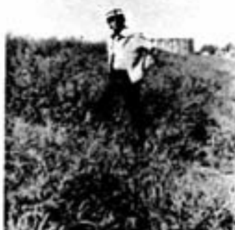
Several projects are currently under way to enhance the appearance of the Port Colborne nickel refinery. One of these is the creation of berms and hills establishing a visual barrier between parts of the plant and the surrounding environment. Chuck Keith , of the engineering department, surveys the progress of work at the north end of the refinery facing Durham Street. The berms are complete except for the planting of trees that will make the visual barrier even higher.