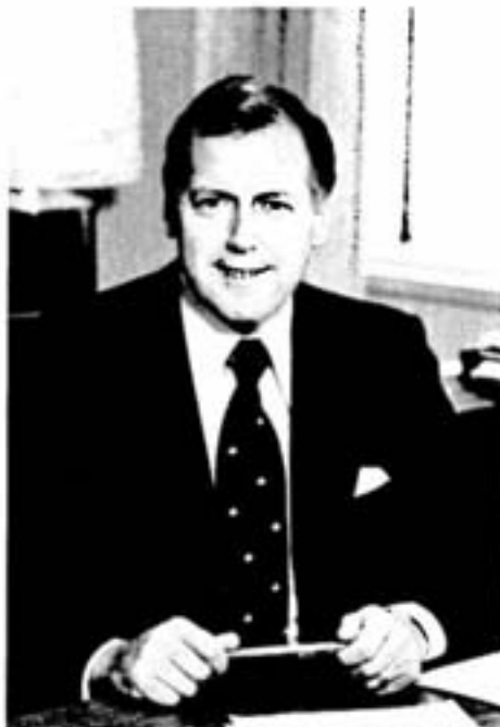
"It is too early to give any meaningful predictions for 1980."

We are indeed expending a lot of effort and money on improving the cobalt recovery from Inco sources. Cobalt has become a very crucial product as the result of the dependence of the western world on African sources which have proved to be unreliable. The cobalt producer price has gone up four-fold over the past eighteen months, and the industry is waiting for more western source material to compensate for the shortfall of African supplies. I would like to compliment both our Ontario and Thompson operations for making every effort to increase cobalt recoveries.