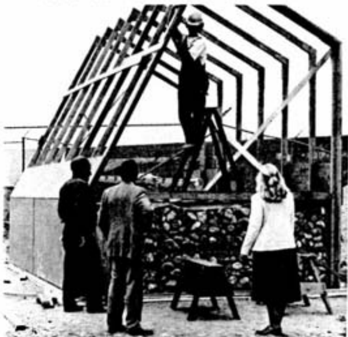
The prototype of an experimental greenhouse , 10 feet wide and 20 feet long, is being constructed adjacent to the Copper Cliff South mine underground air exhaust system. Funded by the Regional Municipality of Sudbury and Inco Metals Company , the greenhouse will utilize mine ventilation air as part of its heat requirement. Expected to be in operation by mid-October, it will be used to grow tomatoes, cucumbers and other experimental crops.