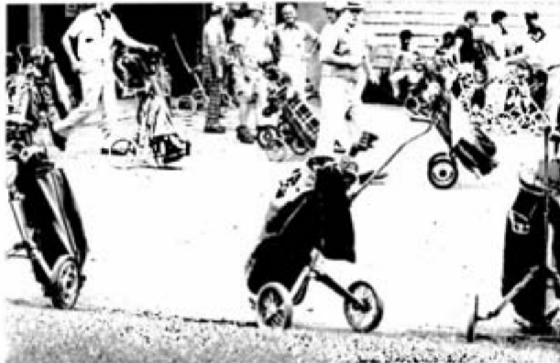
Second draw prepares to tee off at the two-day Sudbury tourney, held early in August at the Idylwyld Golf and Country Club.