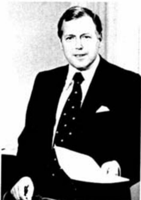
"We believe nickel consumption will hold up for the second half of 1979."

As previously stated, we expect a good business level in the second half of 1979, with worldwide supply and demand of primary nickel in approximate balance. Inco's inventories of finished nickel by the end of June 1979 were 104 million pounds, representing about three months of sales, a level which is normal, perhaps below normal for reasons of marketing logistics.