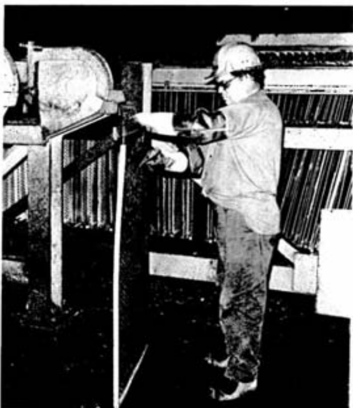
An improvement to the process for producing S nickel rounds is the mechanical cleaning of the sheets before the ink is stripped off.