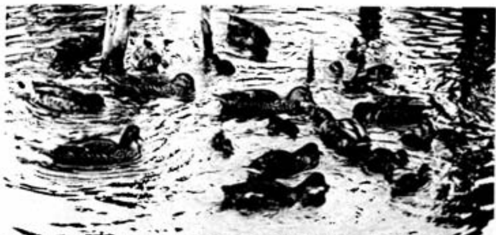
Fine feathered friends! - Ducks have begun to raise their broods in the tailings area ponds.