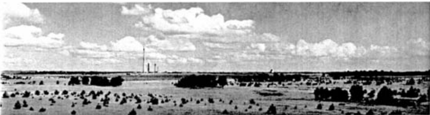
Major portions of the tailings area now boast grass, shrubs and trees, which has meant a return of insects, meadow birds, mice, waterfowl, and shorebirds.